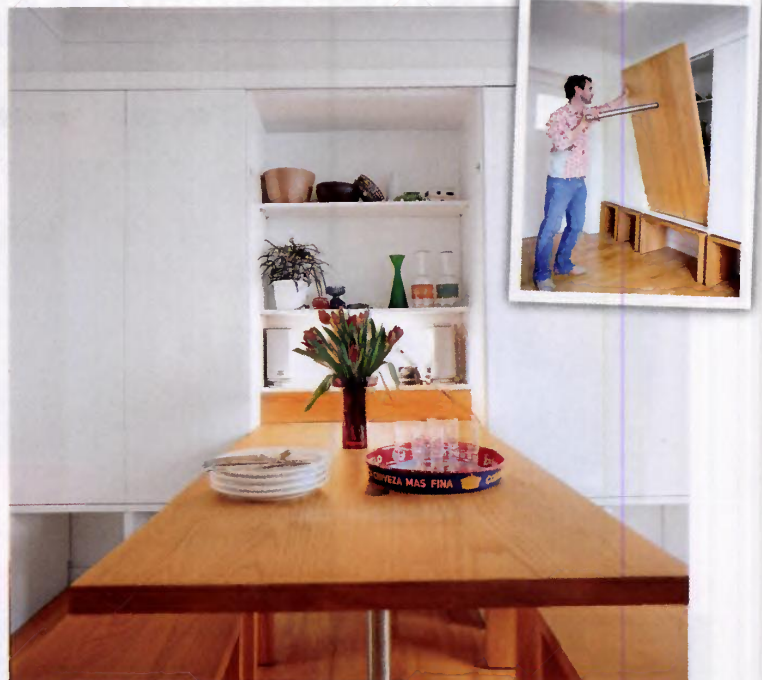
above This dining table folds up to provide extra living space. The stools in this modular lacquered MDF unit, by architect Rob Gregory at around £6,000, are stored underneath